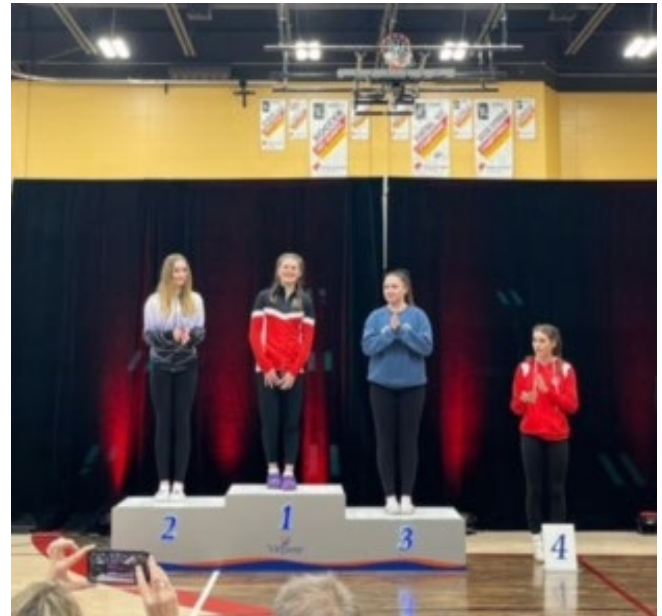
Zie N. 1st Place - L5 15-16 Trampoline, 3 rd – L5 Synchro Trampoline, 6 th – L5 Double Mini.